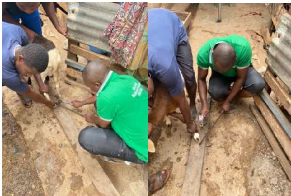
Director of WACPAW clipping the over grown nails of the sheep

The team was in Lamakara a suburb of Tamale for such routine visits and realized that about 12 sheep of one of the farmers could not walk properly and freely due to over grown nails. We quickly set ourselves up to task even though we didn't have modern tools. We managed to clip the nails of all 12 sheep using a machet and a hammer. The farmer was then encourage the farmer to always look out for such problems and try fixing them.