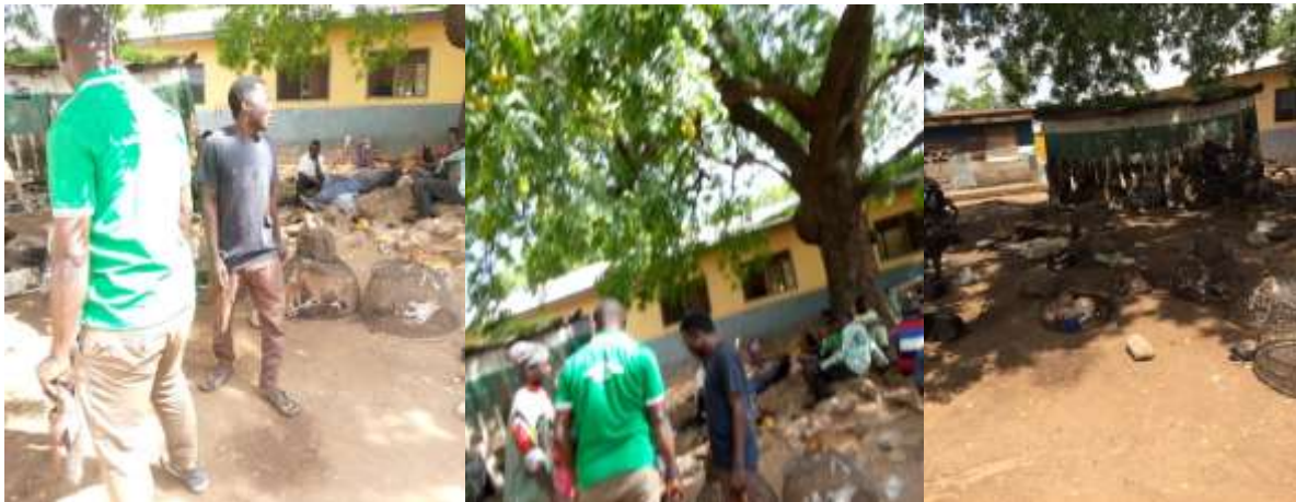
Director of WACPAW at the Dog and Cat market in Bolga.

reach 70 on each market day. Our team observed serious welfare challenges including, lack of food and water, rough handling, untreated injuries and wounds, chained all day, most of them were looking very sick and has never been vaccinated for anything and emaciated. We engaged their leadership on how we could help fix some of the immediate problems and work towards finding alternate source of livelihood them and eventually close the market. They were very open and frank with us. It is our hope and believe that the market would be closed in the near future.